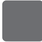
Allied Health Gray