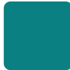
Nursing Support Roles Teal