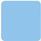
OR Nurses Light Blue