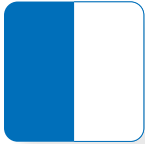
Physicians Blue, White Scrub

You can identify the different members of your multidisciplinary care team members by the color of their uniforms below: