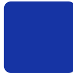
Nursing Registered Nurse Royal Blue