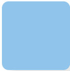
OR Nurses Light Blue