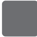
Allied Health Gray