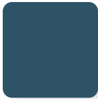
Practical Nurse Caribbean Blue