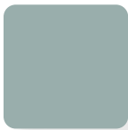
Nursing Unit Clerk Submarine