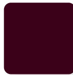
Aid and Receptionist Maroon