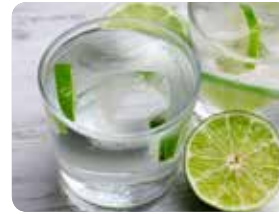
Lemon-lime soft drink