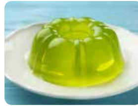
Green or yellow jello