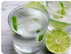
Lemon-lime soft drink