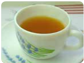
Tea or coffee without milk