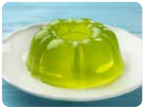
Green or yellow jello