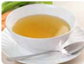
Clear soup (broth)