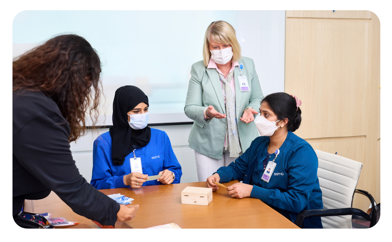
Sheikh Shakhbout Medical City - Tajruba Newsletter

Designed to further improve communication and the patient experience, our recent "Connecting with Empathy" workshops, have shown remarkable results, emphasizing our commitment to patient-centric care.