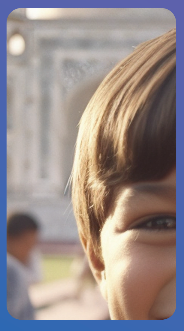
SSMC CELEBRATES EMIRATI CHILDREN'S DAY 2024